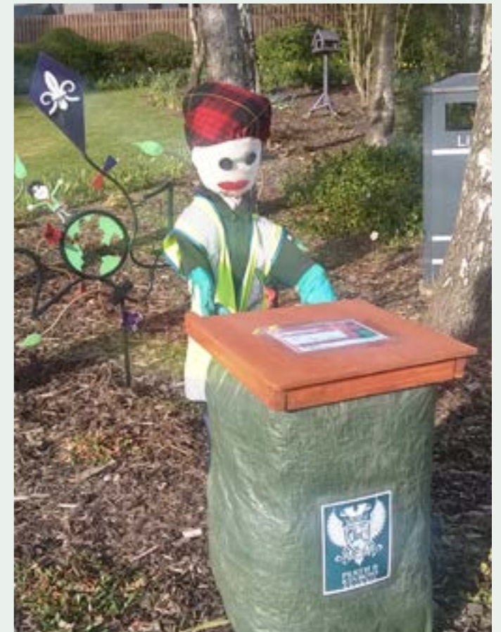
Essential Worker - Binman