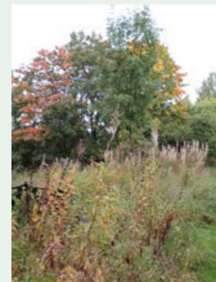
Pitlochry Wildlife Garden - Before