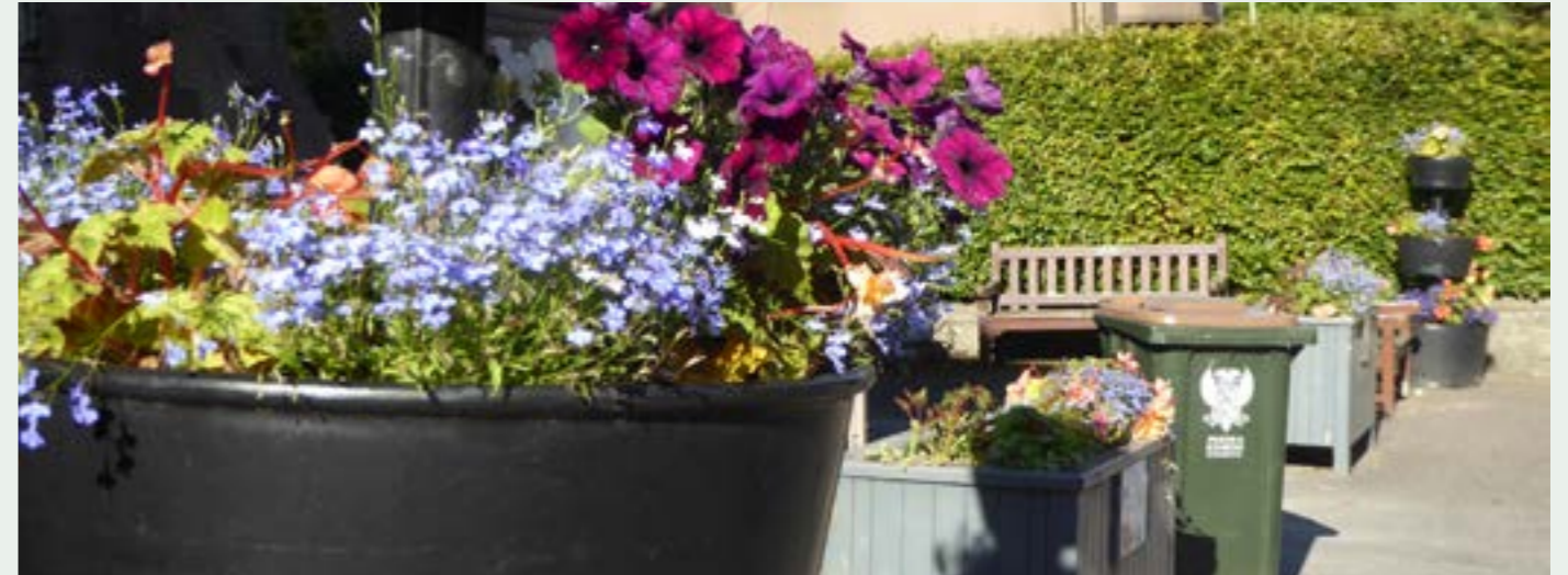
Airlie Street Hall

It has been a busy period in spite of restrictions - the weeds will always grow, the plants will always need tending and the grass will always need cutting, which means Alyth in Bloom will never be short of work!