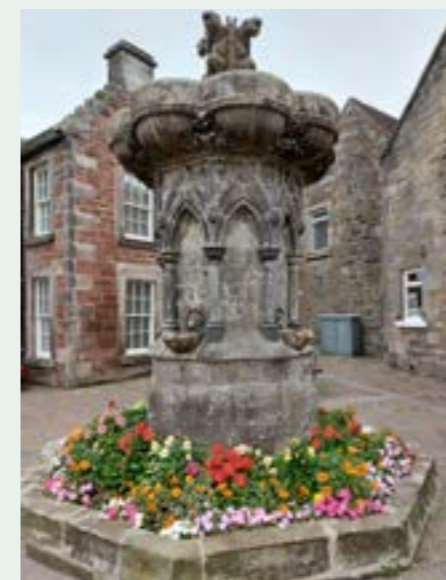
Crosswell Fountain - After