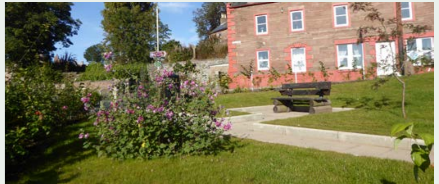
Toutie Street Garden