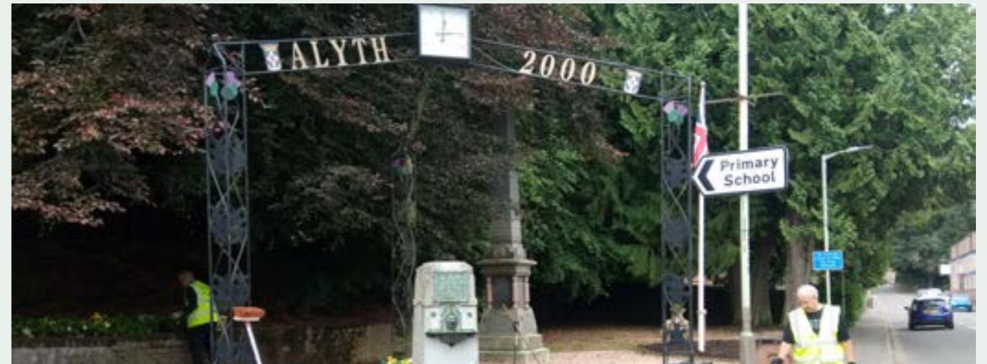
Boer War Memorial Garden