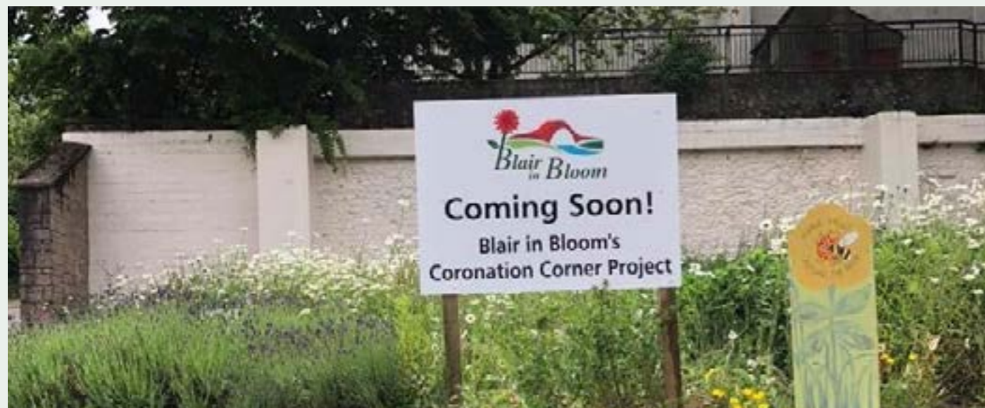
Blairgowrie Coronation Corner - Before

The 19th Century C Listed fountain was structurally in good condition but required some conservation and stabilisation works. Funds totalling £24,000 were secured for the project. A specialist masonry contract was awarded in February 2020 for the works, which started on site in March. The nature of the work meant that it could proceed safely during the 'lockdown' period with a single mason working in isolation. The project will ensure that part of the core-built heritage of Kinross will be preserved for future generations. An Interpretation Board has been designed and manufactured and its location has been agreed close to the fountain. An application for Advertising Consent (planning permission) has been submitted by the Community Council on behalf of Kinross in Bloom.