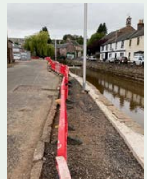
Alyth Burnside Enhancement - During