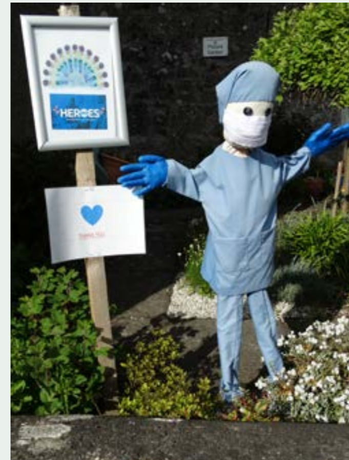
Essential Worker - Nurse