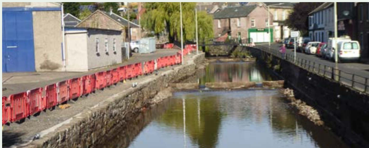
Alyth Burn Side - During